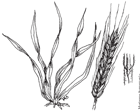
CEREAL RYE ( Secale cereale )

Spring seeding. Although it's not a common practice, you can spring seed cereals such as rye as a weed-suppressing companion, relay crop or early forage. Because it won't have a chance to vernalize (be exposed to extended cold after ger-